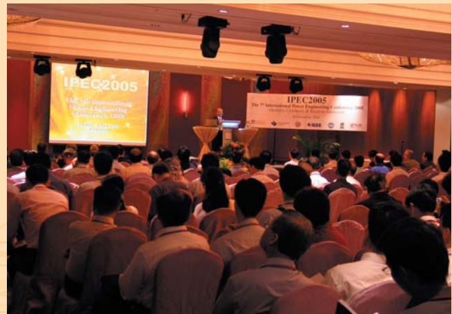
Opening Ceremony of IPEC2005 at Marina Mandarin

The recent changes to the electricity supply industry and potential security threats require re-examination of the reliability, security and operational issues of power markets and infrastructure design. IPEC2005 continues to provide a forum for researchers and practicing engineers in industry alike to promote, discuss and exchange knowledge and experiences related to the field of electrical power engineering.