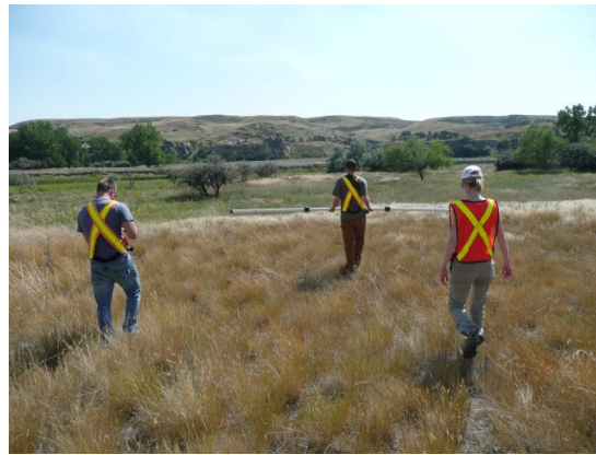
Photo 1: View from the terrace at the base of the cliff towards southeast, across the alluvial plain and towards the Milk River, which can be seen in the background. The EM31 is operated at hip height in VDM.