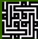
Arabic Calligraphy: 'Muhammad'

It also may serve, as a reminder to Muslims over the ages, that Muhammad (peace be upon him) was, in no way divine and that Muslims ask for God's peace even for His messenger.