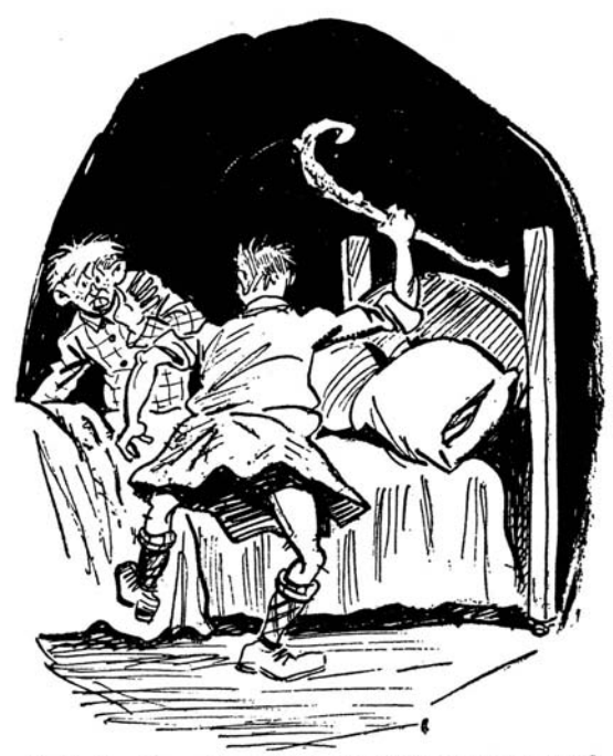
Only the Boonetown bamboozler's agility saved him from a fractured skull.

"Oh, I ain't out of my dome," the freckled pilot snorted. "I just want to swallow some to see if I can hold it. I've been hit with everythin' but the Kaiser's wooden horse, and— Hey, make yourself useful somebody, an' help get this barb wire off me, will ya?"