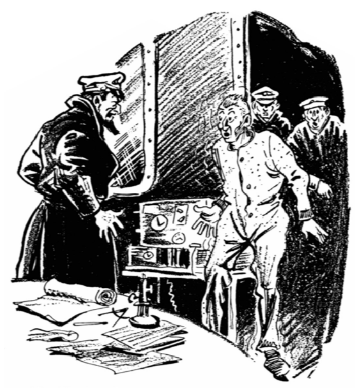
"Das Pingham!" yipped Rudolph. "Ach, Fader, vhere ist der deffil?"

Phineas removed his head phones and chuckled. They were not more than a thousand feet up and still sagging. Hydrogen was escaping all over France. That chocolate bar—the thought of it made him guffaw. But if Phineas had known what was transpiring in the gondola of the L-72 he would not have bothered to laugh. An indignant half-frozen Kraut with a duelling scar across his left headlight was barging into the control pit. Clad in a heavy union suit and nothing else, he faced a stupefied Herr Papa.. A disc hung from his neck, bearing the crest of a well-born Junker tribe.