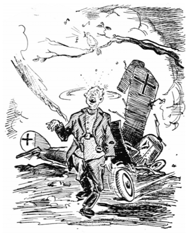
Von Sputz walked away with a big gap in his front teeth. When that Pfalz kissed Mother Earth, he'd kissed the instrument board.

"HAIL, THE CONQUERING HERO COMES!" TO THOSE ROUSING STRAINS, THE BRASS HATS PARADED PHINEAS BACK TO THE STATES. AND SO, GARRITY REJOICED AS PEACE FINALLY REIGNED ONCE MORE ON THE DROME OF THE 9TH. BUT HOW WAS THE MAJOR TO KNOW WHICH WAY THE PINKHAM PARADE WAS HEADED? AND WHO'D HAVE EXPECTED THE VON SPUTZES TO SUPPLY THAT PARADE WITH ITS MAIN "FLOAT"?