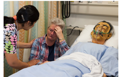
ER Mash Up