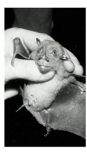
Figure 2. The two most critically endangered species found in the NNFR: the Writhed-billed Hornbill and the Tube-nosed fruit bat.